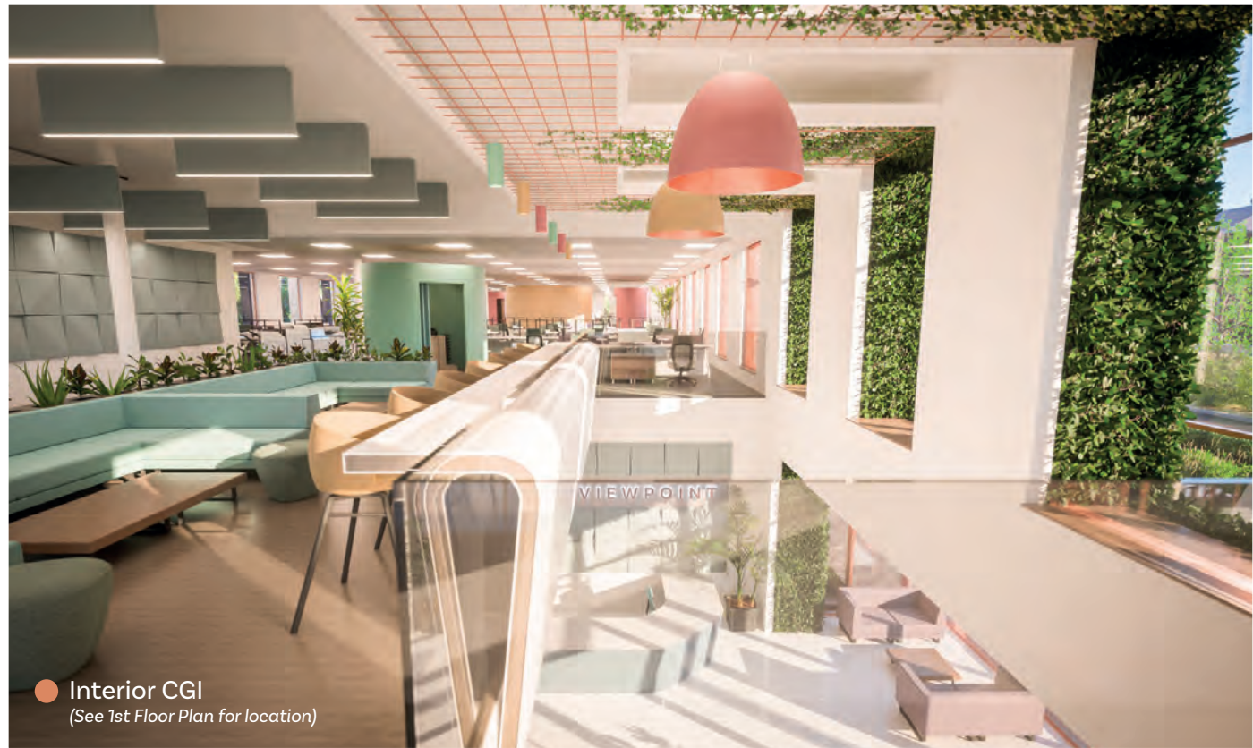
● Interior CGI (See 1st Floor Plan for location)